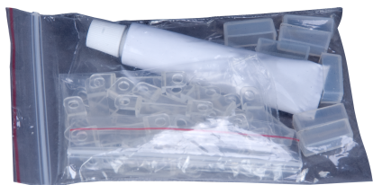
FLEX IP CLIP KIT (FLEX IP CLIP KIT)