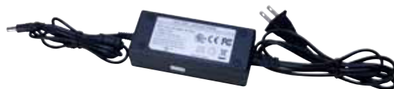
FLEX PIXEL 5VPSU (FLE781)

Dimensions: L: 4.92" (125mm) W: 2.16" (55mm) H: 1.18" (30mm)