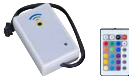
FLEX PIXEL IR (FLE755)