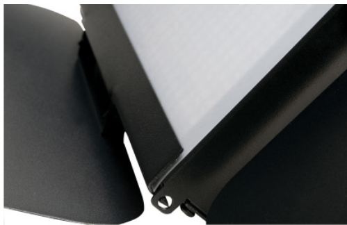
Magnetic Gel/Diffuser Holder