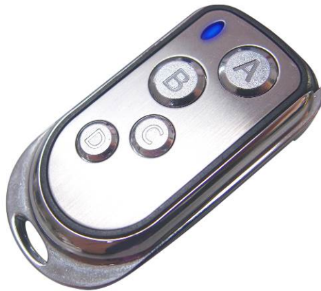
W-2 Wireless Transmitter

Wireless remote control system W-2 consists of a transmitter equipped with four buttons to turn faze output on or off, and adjust output volume; with an onboard receiver attach to the rear panel of Z-380.