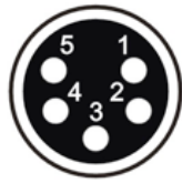
DMX Output 5-Pin XLR Socket